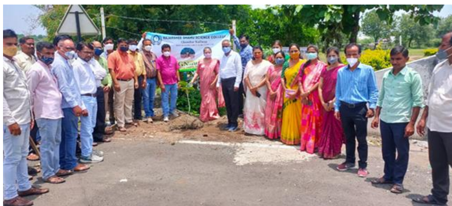
Tree Plantation Program 4 th July 2021 organised by SIGNature